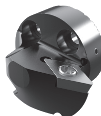
SDNC 62°30' AVH