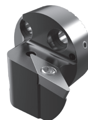
SVUB 87° AVH