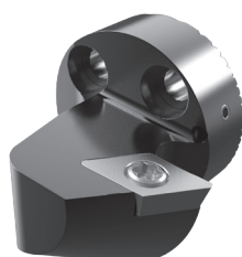
SDXC 93° AVH