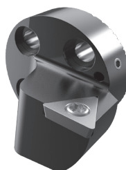
STFC 89° AVH