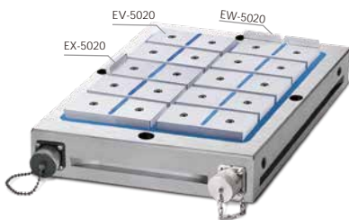
Pole-extensions AA (Optional)