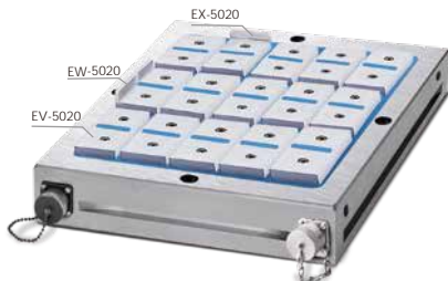
Pole-extensions BB (Optional)