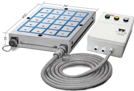
BRISC-AA*1 + CUA-H / CUD-H