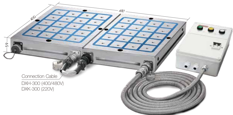
BRISC-AA*2 + CUA-H / CUD-H